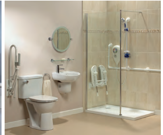
Option 3: Extended Grab Rail Kit