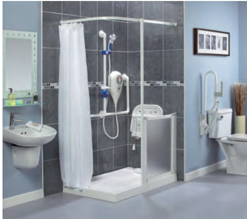
Option 2: Corner Grab Rail Kit