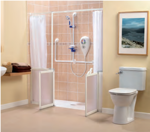
Option 1: Alcove Grab Rail Kit